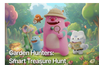
Garden Hunters: Smart Treasure Hunt