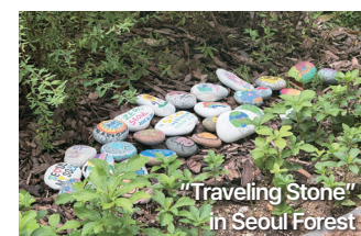
"Traveling Stone" in Seoul Forest