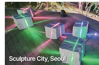
Sculpture City, Seoul