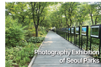
Photography Exhibition of Seoul Parks